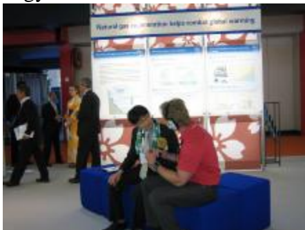
Interview by a local radio station