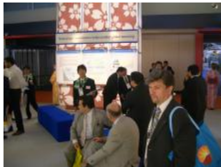
JGA booth crowded with visitors