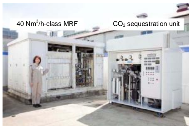
Figure 3 Appearance of 40 Nm 3 /h-class MRF combined with CO 2 sequestration unit

25.1 kg/h to 12.6 kg/h, which translates into a reduction ratio of 50%.