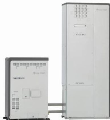
Figure 2 "Ene-Farm Type S" Residential-use SOFC Cogeneration System

Durability was the biggest issue in starting commercial development. As SOFC systems are expected to operate continuously, the total operational period is expected to exceed 80,000 hours for the service life of 10 years. After successfully demonstrating the required system performance in fiscal 2005, more than 100 units were subjected to field tests (mainly within the framework of SOFC-related experimental study projects of NEDO) to evaluate the long-term stack durability, to test each component, and to analyze the results. After being assured that the target service life could be realized, the SOFC-based "Ene-Farm Type S" products were released in April 2012.